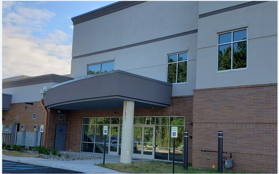
DOI's new location at 1351 West North Street

The Department of Insurance is officially in its new Dover location at 1351 West North Street, Suite 101. The new space offers staff and consumers nearly 3,500 square feet of additional space and more parking. Building security has also been boosted with an added camera system. The move was an initiative sparked by Commissioner Navarro's concern for the cost of rent at the Department's previous location.